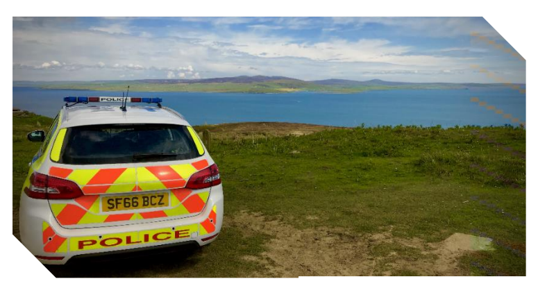
Overlooking Orphir - M Thain

To identify the Orkney local policing priorities for 2020-2023 we have utilised a wide range of information, intelligence and processes including an extensive process of consultation, which include: