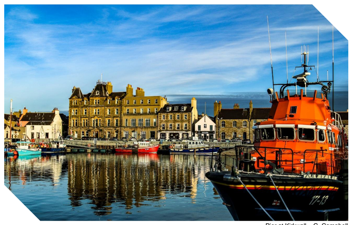
Pier at Kirkwall

Local Area Commander and or their deputies, will continue to engage with elected members, communities, community councils and other key stakeholders.