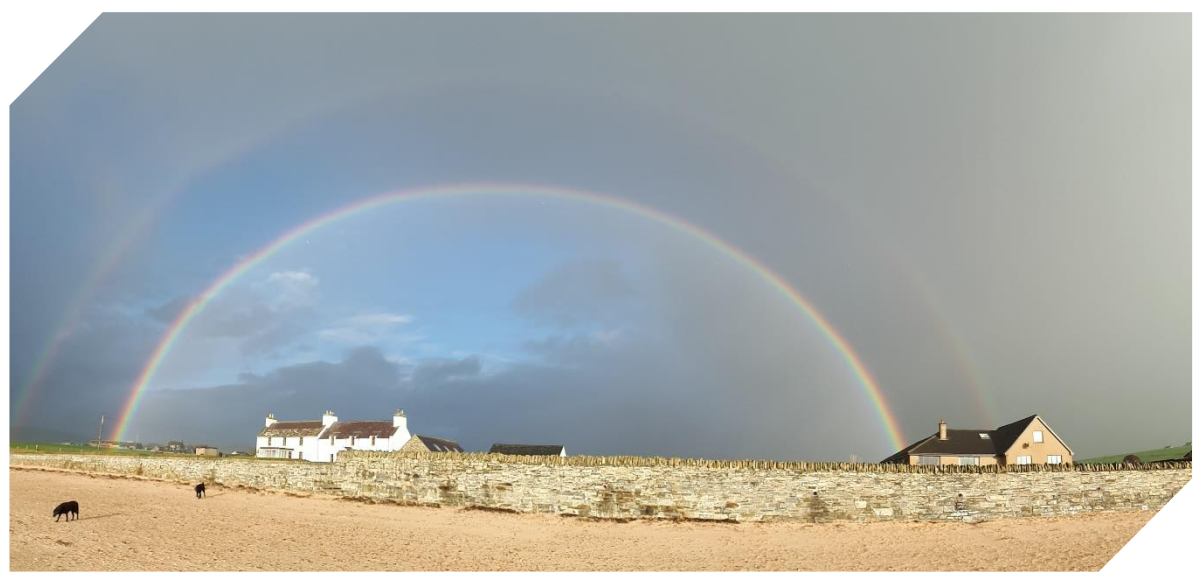
Scapa Beach, Orkney - M. Webb

plans and performance framework. Equality and Human Rights Impact Assessment (EqHRIA) is used to help us to ensure that policy and practices proactively consider the potential impact on equality and human rights. We will ensure that all of strategic plans and activities relating to delivery are assessed to a high standard using relevant evidence in a systematic and structured way.