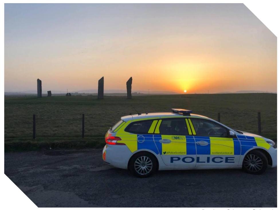
Brodgar, Orkney

We will continue to work with businesses including financial institutions to prevent people and companies being the victim of scams and we will educate our communities on how to keep themselves safe from this type of criminal activity.