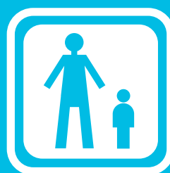
Child Abuse including Child Sexual Exploitation