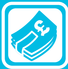
Serious Organised Crime