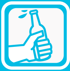
Antisocial Behaviour / Disorder