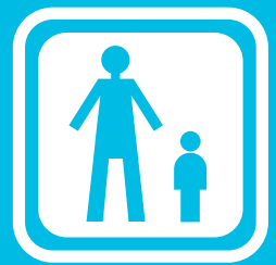
Child Abuse including Child Sexual Exploitation