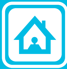
Homes being broken into