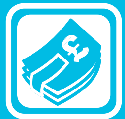
Serious Organised Crime