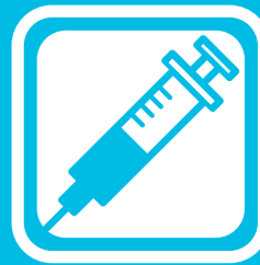
Drug Dealing / Drug Misuse