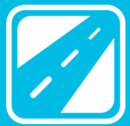
Road Safety / Road Crime