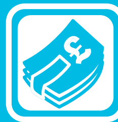
Serious Organised Crime