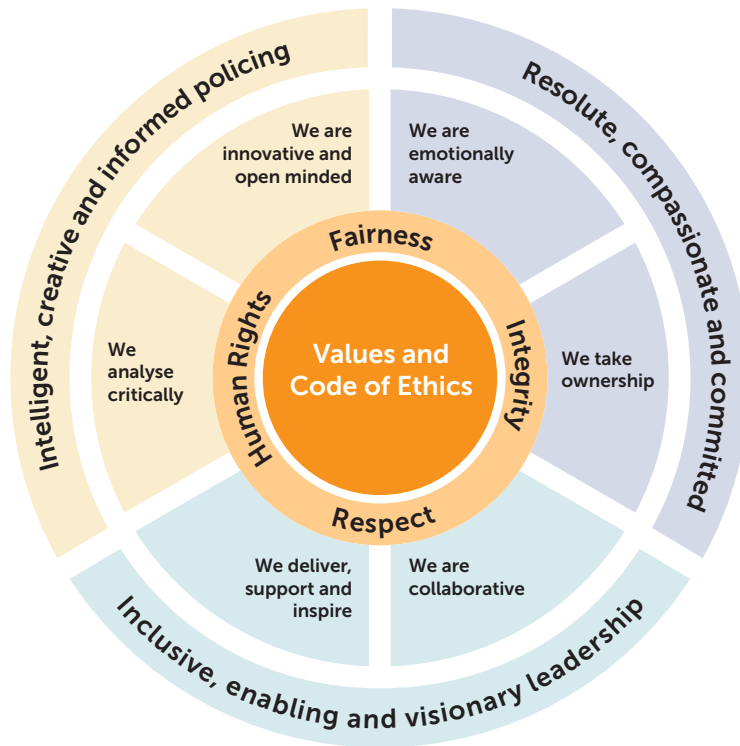
Fig 2 Competency and Values Framework