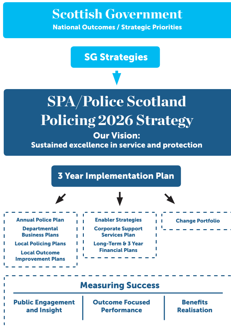
Fig 1 Strategic Planning & Performance Framework